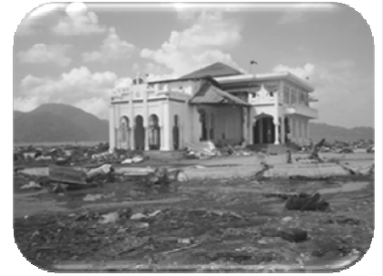
Masjid in Banda Aceh after Tsunami

So, what is general for humans is that they are deficient and they do not observe all the obligatory duties. There-